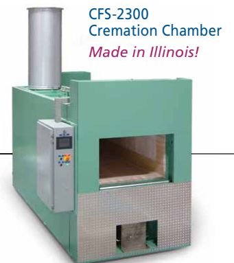
CFS-2300 Cremation Chamber Made in Illinois!

Cremation Systems offers complete turnkey crematoriums, cremation chambers, and a wide range of products and services, including combustion and control, refractory repair, and complete cremator rebuild.