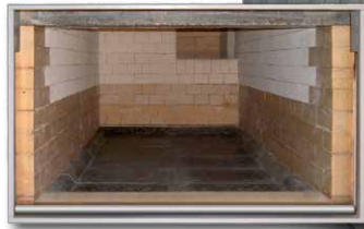
CFS-2300 Human and Pet Cremation Chambers