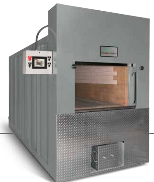
CFS-2300 Cremation Chamber Made in Illinois!

Hearth replacement with a traditional cast-in-place hearth requires the use of jackhammers, refractory mixers, specialized labor and on-site curing. The Quick Change system offers the fastest repair option in the industry. Simply remove the worn and damaged tile and replace.